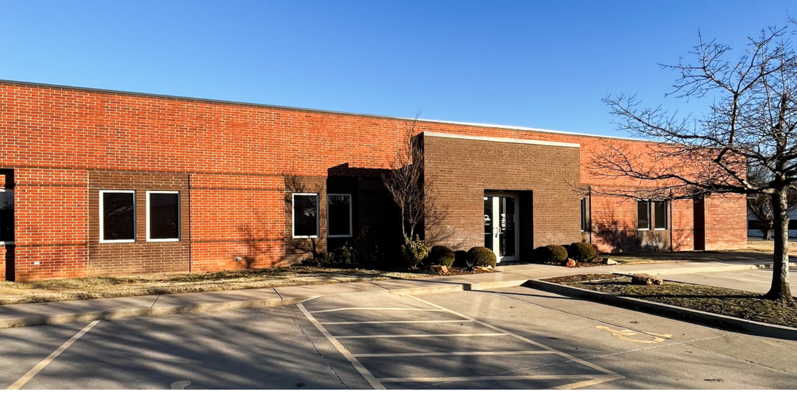
2402 Westport Dr, Norman, OK 73069